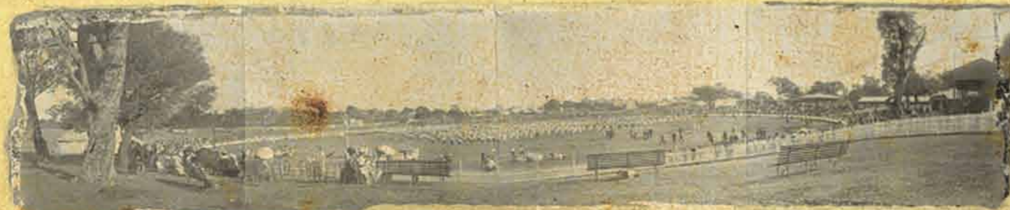
Royal Agricultural Society Grounds 1905-1912