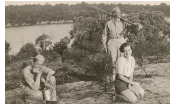
MISS KELLY AND TWO AMERICAN SERVICEMEN AT BLACKWALL REACH, 1942.