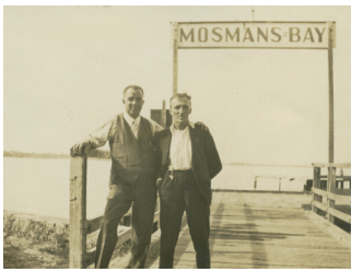
TWO MEN ON THE MOSMAN BAY JETTY DURING THE FLOODS OF 1920.

It is hard to imagine this quiet suburb as an isolated 'country town' or the home of large-scale industry. Yet once this was a place of open bushland and large factories that lined the river and the highway. Going to 'the pictures' or a local dance was a treat for hardworking residents on Friday and Saturday nights, while Sundays were reserved for family fun at the river or the beach.