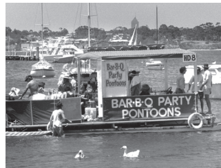
BAR-B-Q PARTY PONTOON ON THE SWAN RIVER, MOSMAN PARK, 1989.

The Grove Library maintains a community history collection about the people, places and events that have shaped the history of Cottesloe, Peppermint Grove and Mosman Park.