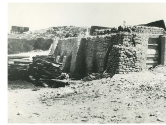
LIME KILNS ON BUCKLAND HILL, c. 1920.

The Warden Beelie Bidi is part of the Whadjuk network of walking trails that connects remnant bushland areas in Perth's western suburbs. To download the free App for the Warden Beelie Bidi and other Whadjuk Trails, or for additional information on the Whadjuk network of walking trails, please visit: www.whadjukwalkingtrails.org.au