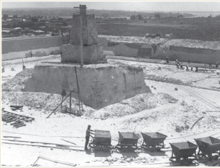
THE CONSTRUCTION OF A RESERVOIR AROUND THE OBELISK ON BUCKLAND HILL, 1935.

Participants following the trail do so at their own risk.