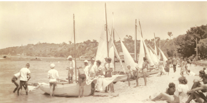
HOMEMADE SKIFFS ON THE MOSMAN BAY FORESHORE, c. 1948.