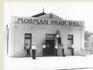
THE RETURNED SERVICEMEN'S LEAGUE (RSL) HALL, WHICH ONCE STOOD ON THE CORNER OF SOLOMON AND JOHNSTON STREETS, 1938.

1962 — The Shire of Mosman Park is designated the Town of Mosman Park .